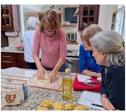
Check our new recipe of the month Fresh Pasta with Bolonase sauce from our Activity Group, Mangia Con Noi, only on our website