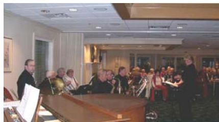
Great turnout for HHP's Jazz Band debut concert!