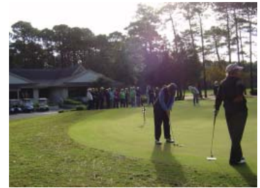
(right) Bear Creek Annual Putt Off

The BCGC 9-Hole and 18-Hole Women's Golf Associations wrapped up their 2009 seasons with a combined Closing Day Scramble and Luncheon. A highlight of the day was the annual "Putt Off" with top finishers from each association squaring off for bragging rights.